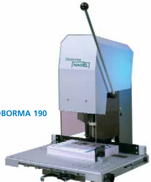
NAGEL CITOBORMA 190 table top.