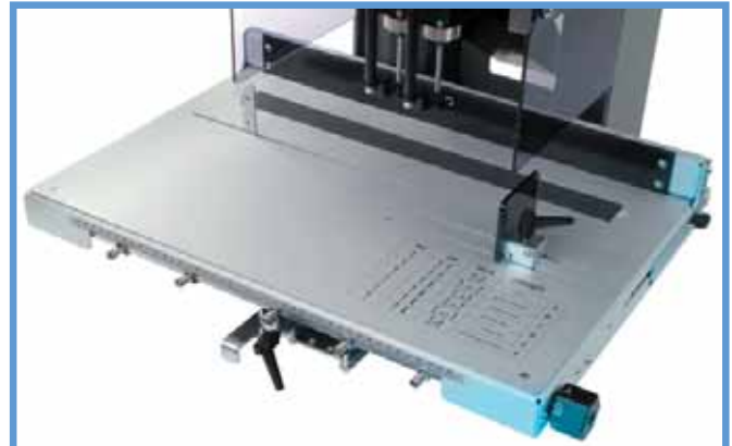
For operator's convenience: The quick release FlexoDrill® sliding table.