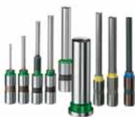
Nagel paper drill bits: 2–35 mm diameter, 50–60 mm working length. and special designs.

The special cardboard drilling pads by NAGEL ensure that even the last sheet of the pile is perforated cleanly; they also reduce wear on the plastic support bar.