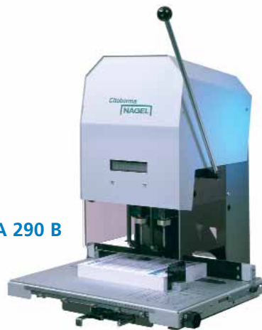
NAGEL CITOBORMA 290 B table top.