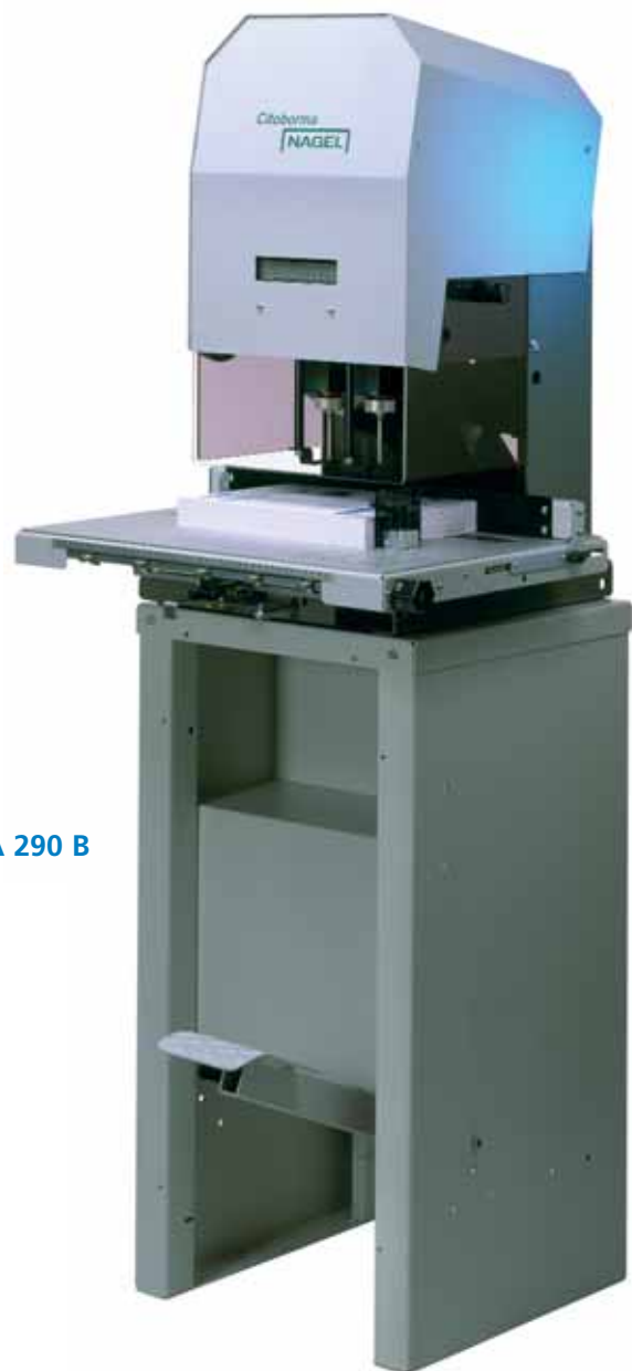
NAGEL CITOBORMA 290 B with treadle.