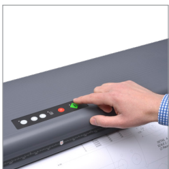
Flexible control panel for easy handling

Scan and document all your architectural, engineering and construction plans in standard file formats directly into your project folders.