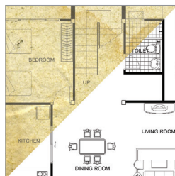
Improve your originals