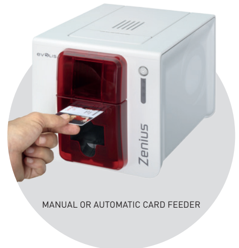
MANUAL OR AUTOMATIC CARD FEEDER

Easy handling, automatic ribbon recognition and setup