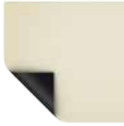
Video Spectra 1.5