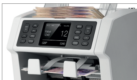
Value-mix: Counts banknotes in stacks of a preset value